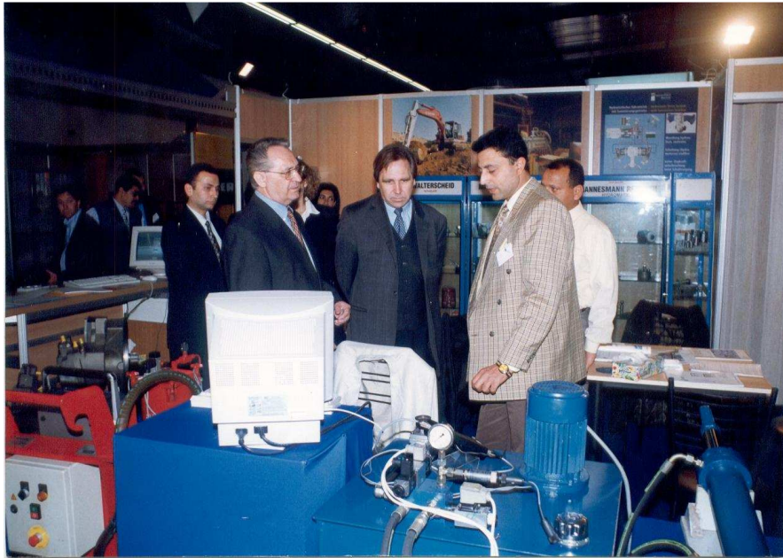
Computer monitoring of hydraulic power pack working condition