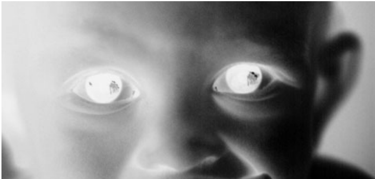
Figure 1: Original eyes.pgm image

For example, I have included a copy of the original eyes.pgm image in figure 1.